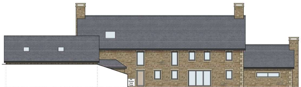
Proposed North West Facing Elevation Scale 1:100