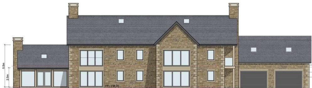
Proposed South East Facing Elevation Scale 1:100

This drawing is to be used in conjunction with all relevant Architectural, structural and specialist design and specifications. The Architect is to be notified of any developments before proceeding. Do not scale from this drawing. All dimensions and levels are to be checked on site. This drawing is subject to copyright. All work contained herein Planning and Building Permission has been granted. All the contractors/clients use. Note: proposed drawings based on CIP data information. All structural dimensions are dependent and all dimensions are to be checked on site and agreed by the survey.