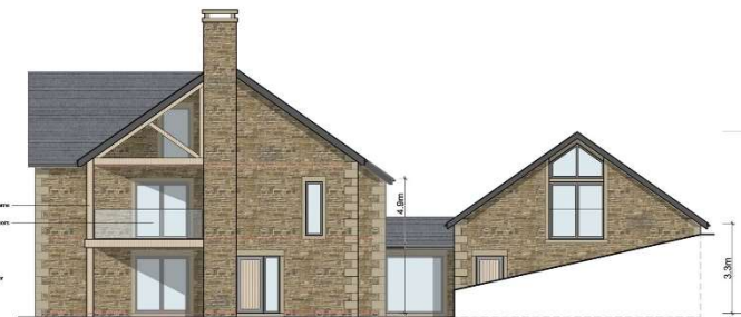
Proposed North East Facing Elevation Scale 1:100