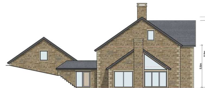
Proposed South West Facing Elevation Scale 1:100