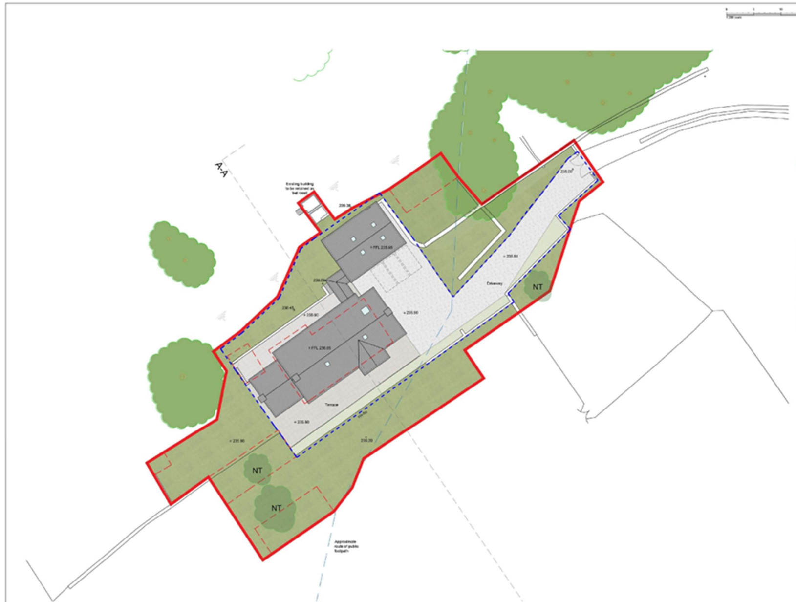
Proposed Site Plan Scale 1:200